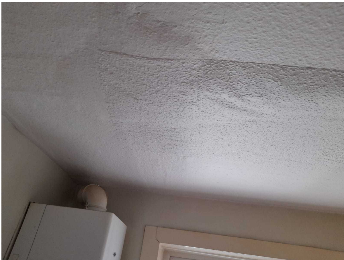
Damage in Angela McCabe's flat

After the sewage pipe was repaired in December, Angela redecorated her bathroom... but days later water began leaking through the light fitting.