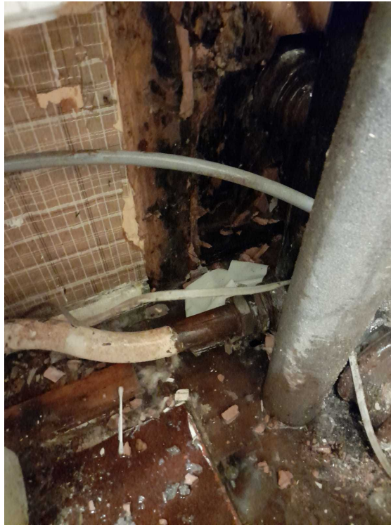
Damage in Angela McCabe's flat

It took until December 22 - around five weeks - for the pipe to be repaired, despite raw sewage leaking into Angela's flat when neighbours flushed their toilets.