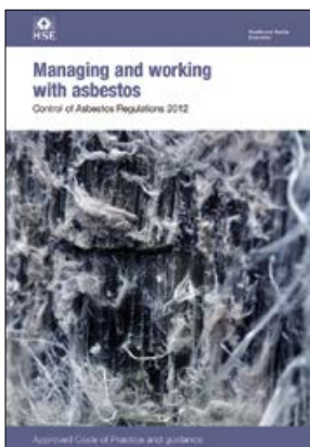
L143 (Second edition) Published 2013

This publication contains the Control of Asbestos Regulations 2012, the Approved Code of Practice (ACOP) and guidance text. Two ACOPs, L127 ( The management of asbestos in non-domestic premises ) and L143 ( Work with materials containing asbestos ) have been consolidated into this single revised ACOP. The presentation and language has been updated wherever possible. It provides guidance text for employers about work which disturbs, or is likely to disturb, asbestos, asbestos sampling and laboratory analysis. It also provides guidance on the specific duty to manage asbestos on the owners and/or those responsible for maintenance in non-domestic premises.